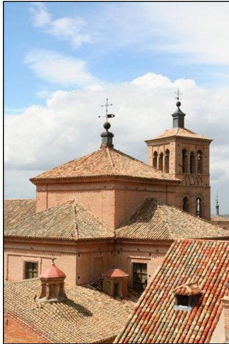
Church of Santo Tomé

Transfer to Madrid's International Airport for return flight to USA. Arrive home in the evening of the same day.