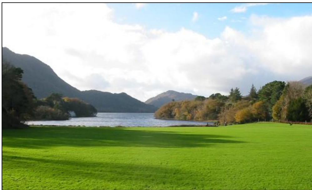
Lakes of Killarney

Transfer to Dublin's International Airport for return flight to USA. Arrive home in the evening of the same day.